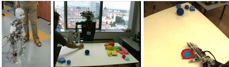
Fig. 1. Left: RobotCub humanoid platform iCub. Middle: humanoid robot Baltazar in its workspace. Right: view from one of Baltazar's eyes during a grasping task.

To reach for an object, two distinct phases are considered: 8 (i) an open-loop ballistic phase is used to bring the manipulator to the vicinity of the target, whenever the robot hand is not visible in the robot's cameras; (ii) a closed-loop visually controlled phase is used to make the final alignment to the grasping position. The open-loop phase (reaching preparation) requires the knowledge of the robot's inverse kinematics and a 3D reconstruction of the target's posture. The target position is acquired by the camera system, where the hand position is measured by the robot arm joint encoders. Because these positions are measured by different sensory systems, the open-loop phase is subject to mechanical calibration errors. The second phase, grasping preparation, operates when the robot hand is in the visible workspace. 3D position and orientation of target and hand are estimated in a form suitable for Position-Based Visual Servoing (PBVS). 4,6 The goal is to make the hand align its posture with respect to the object. Since both target and hand postures are estimated in the same reference frame, this methodology is not prone to mechanical calibration errors.